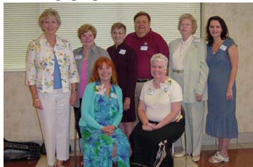
Hall of Fame Members